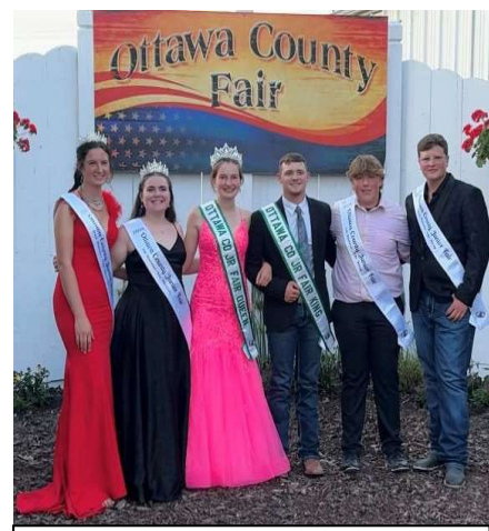
2024 Ottawa Co. Jr. Fair Royalty

Judges scoring will be based on the following criteria for a total of 100 points: