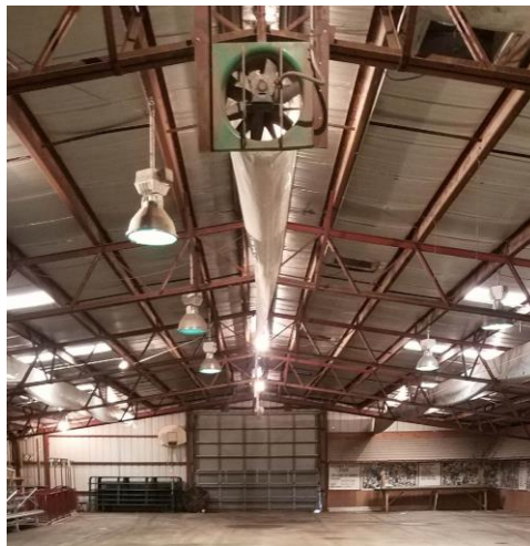
Show barn at the Ottawa County Fairgrounds

$15,000. Two fans, signage and installation costs.